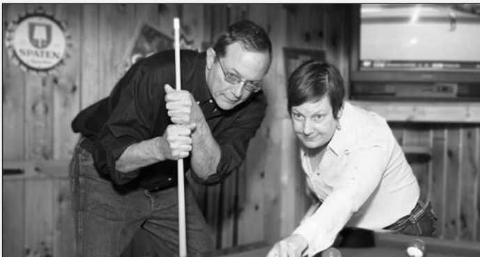
Scene from Flowers In The Desert, 2014.